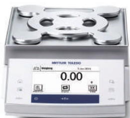
ELECTRONIC WEIGHING BALANCE