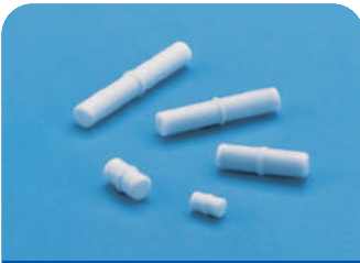
Micro Spin Magnetic Stirring Bar