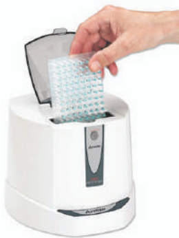
MINI PLATE CENTRIFUGE