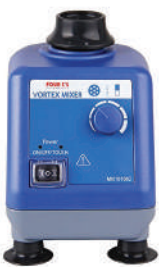
VORTEX MIXER/ SHAKER