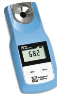
OPTi Digital Handheld Refractometer

We offer a full range of YSI and SI Analytics products for water quality, flow, and level. Handheld instruments for measuring a variety of parameters, including pH, conductivity, temperature, TDS and DO, are used to test irrigation channels, wash water, retention basins and in hydroponics.