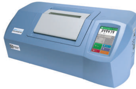
Single/Dual/Multiple Wavelength Polarimeter ADP600 Series with Temperature Control