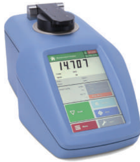
Digital Refractometer, Peltier, Touch, RFM340-T

Bellingham + Stanley is a Xylem brand, and a manufacturer of high-quality digital refractometers and polarimeters used globally especially on the food & beverage market.