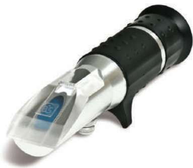
Optical Handheld Refractometers